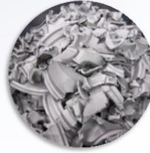
Patented Cleaning Process