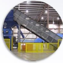
Size Reduction and Quality Control