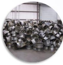
Recycled Aluminum Wheels (A356/AISI7Mg)